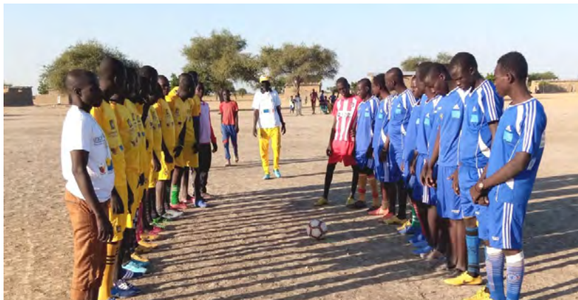
A football match in Warou on the occasion of the Peace Tournament, which raised awareness amongst 600 people about violence against children, the culture of peace and the link between religious and formal schools.