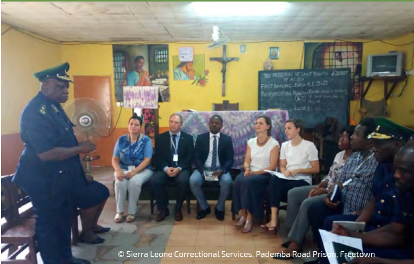
Pademba Road Prison, Freetown

Sierra Leone retains the death penalty for aggravated robbery, murder, treason and mutiny. Although a de facto moratorium is in place with the last executions taking place in October 1998, death sentences are still routinely pronounced. At the end of 2020, there were 78 persons on death row, an increase of over 50% from August 2019. Recent sentences from the Kabala High Court Criminal session in September 2020 saw one woman sentenced to death. The EU, together with AdvocAid and like-minded partners, is committed to the abolition of the death penalty by advocating improved access to legal representation and effective right to appeal for prisoners on death row, as well as by promoting legal reforms in view of the in law abolition of the mandatory death penalty sentence.