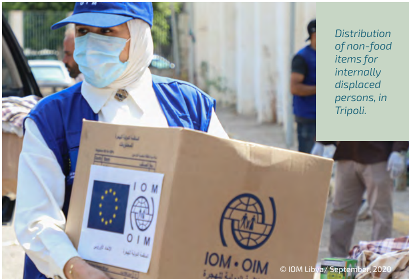
Distribution of non-food items for internally displaced persons, in Tripoli.

Since its establishment in 2014, the EU Regional Trust Fund in response to the Syrian crisis (the 'Madad' Fund) has reached EUR 2.2 billion. It covers programmes on education, livelihoods, health, socioeconomic support, water and waste infrastructure – benefiting both refugees and their host communities. More than EUR 2 billion of this fund was allocated to more than 90 projects to the Trust Fund's implementing partners on the ground, now reaching more than 7 million beneficiaries.