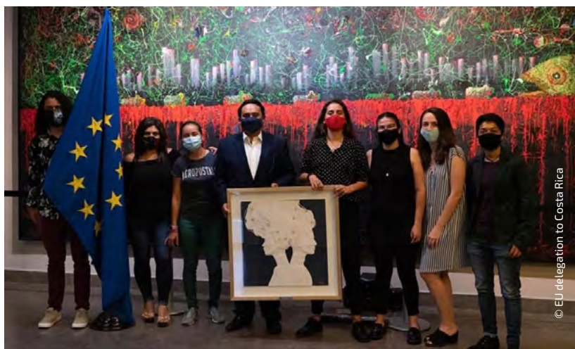
Members of Fundacion GOLEES – recipients of Second edition of EU Gender Equality Award in Costa Rica.

foundations, the private sector, awareness-raising campaigns and advocacy events. Furthermore, specific initiatives were undertaken to address existing inequalities and multiple and intersecting forms of discrimination against women and girls, which are often entrenched and systemic, to eliminate all forms of sexual and gender-based violence, and to promote women's and girls' full and equal enjoyment of all human rights and their empowerment, active, full, effective, free and meaningful participation.