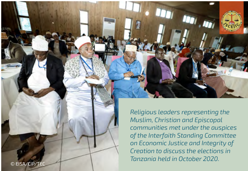
Religious leaders representing the Muslim, Christian and Episcopal communities met under the auspices of the Interfaith Standing Committee on Economic Justice and Integrity of Creation to discuss the elections in Tanzania held in October 2020.

The Intercultural Learning Exchange through Global Education, Networking and Dialogue (iLEGEND) joint programme of the EU and the Council of Europe shared similar objectives by fostering intercultural dialogue, participation, capacity building and exchange of good practices.