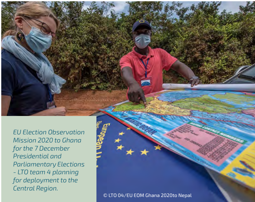
EU Election Observation Mission 2020 to Ghana for the 7 December Presidential and Parliamentary Elections - LTO team 4 planning for deployment to the Central Region.

Moreover, the project provided key support for i) the revamping of the AGORA platform, ii) a multi-stakeholder knowledge-sharing online hub on parliamentary development, as well as iii) the Inter-Parliamentary Union's Centre for Innovation in Parliament. It also started to produce a series of e-learning modules on key parliamentary matters.