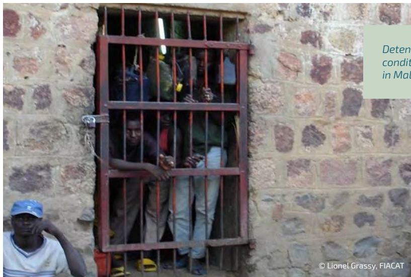
Detention conditions in Mali